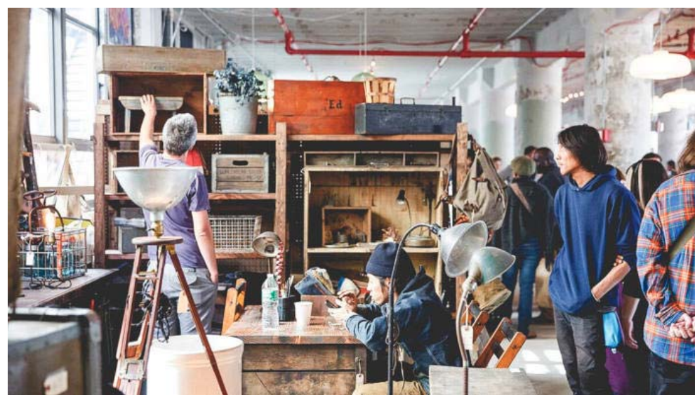
Brooklyn Flea at Industry City

In the complex, visitors enjoy artisanal coffee from the Extraction Lab, which comes in at a scalding $18 a cup; sample $15 avocado burgers from Avocaderia — "the world's first avocado bar"; and peer through the glass at the tantalising production line of Li-Lac, New York's oldest chocolatier's latest outlet. A cavernous table-tennis gymnasium and a crazy golf course offer ample opportunities to relax.